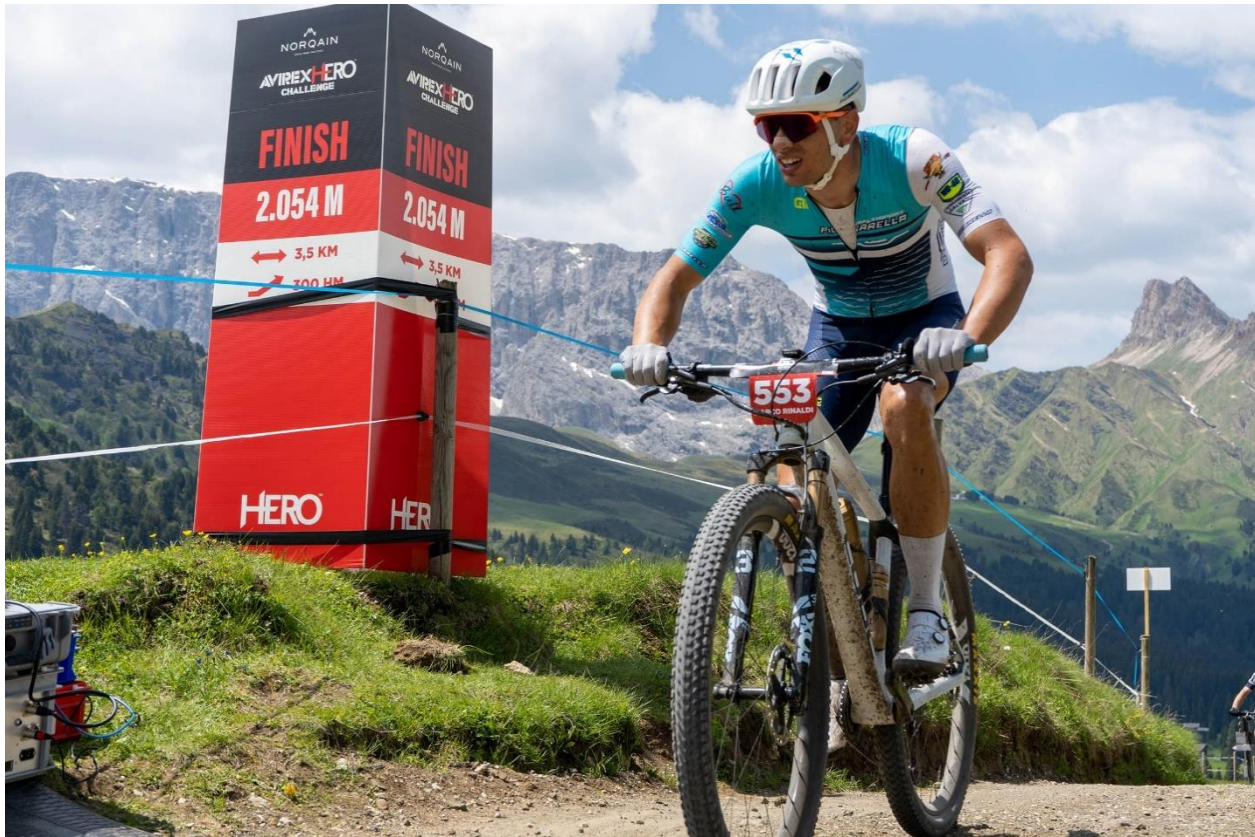
HERO Südtirol Dolomites

The challenge was inspired by Top Gun – a fighter jet pilot pursuing his taste for freedom and speed with grind and passion in his everyday life. Just like in the film, the challenge aims to raise the energy levels of what is one of the most awaited races in professional mountain bike events for both pros and amateurs.